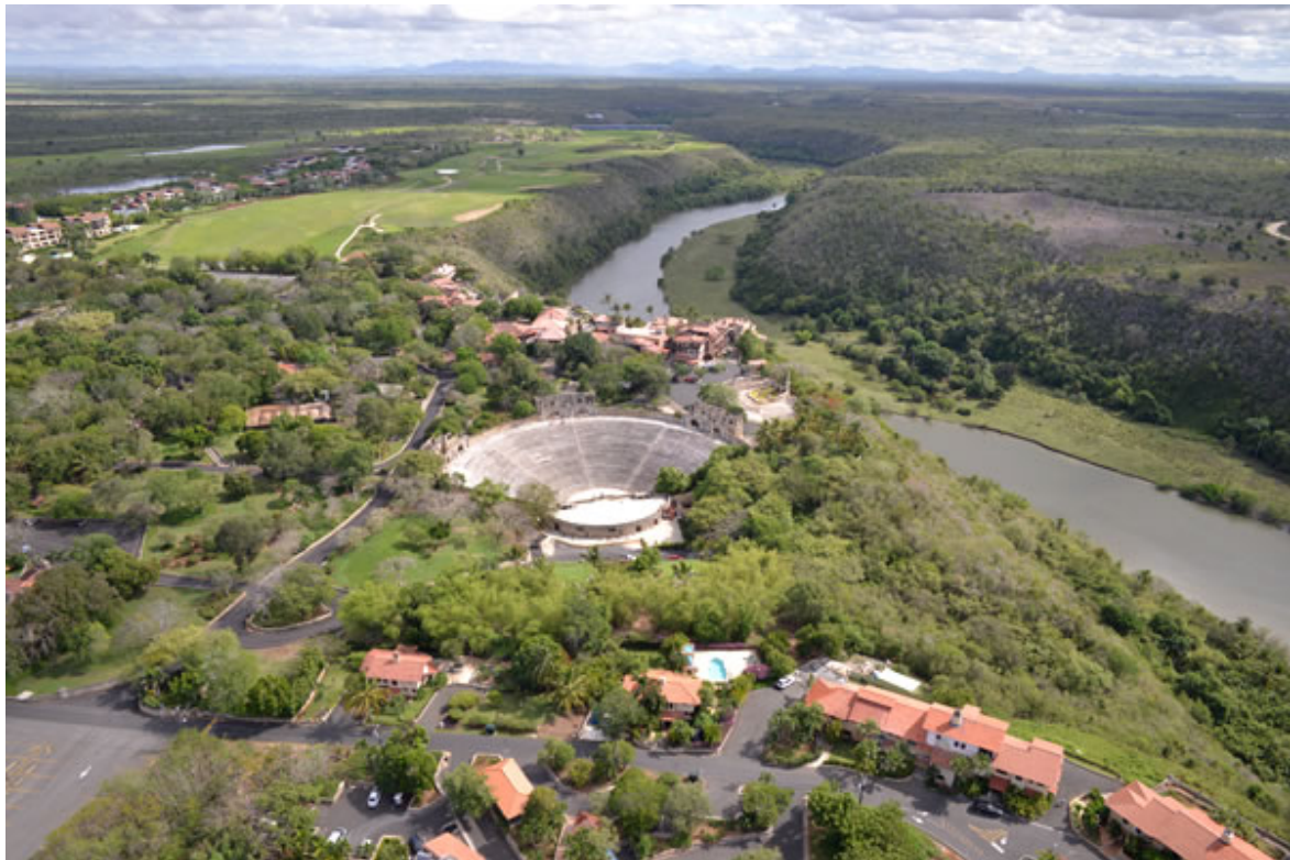
The Altos de Chavón School of Design in La Romana, Dominican Republic, will host the Davidoff International Art Residency in January 2015

In collaboration with Altos de Chavón, hailed as the country's leading institution for art and design education, the Davidoff International Art Residency will host five selected emerging to mid-career artists from around the world each year, for a period of ten weeks. One of the positions may be filled by an international curator or art writer researching Caribbean art.