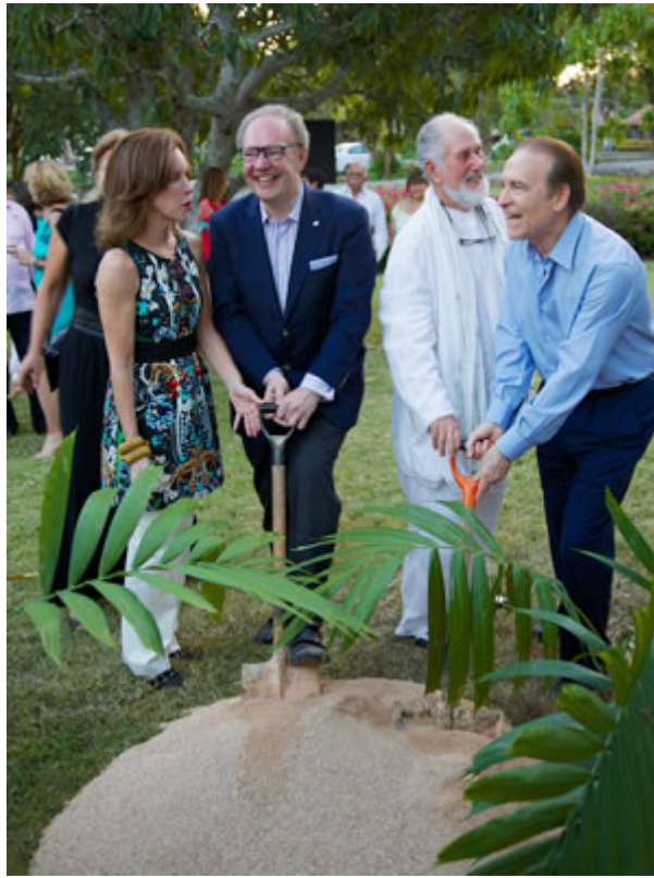
The groundbreaking ceremony for the Davidoff Art Initiative artist's studios at Altos de Chavón